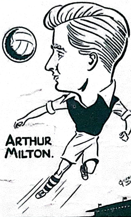
A comparative newcomer to the Arsenal side who promises well at outside right.