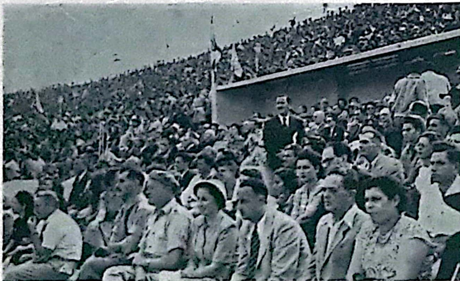
A section of the huge crowd assembled at the New Ramat Gan Stadium for Hapoel's match with Dundee. This picture shows the Prime Minister's box.